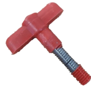
Standard M6 Red PCB Thumb