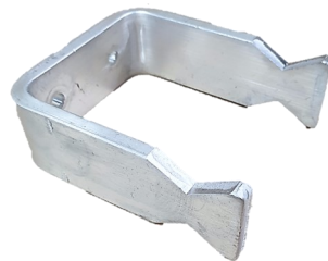
BSC6 Aluminium Cradle 30mm X 6mm BSC6-75 — 75mm Long BSC6-94 — 94mm Long