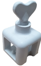
BCS2 Plastic Block With Screw