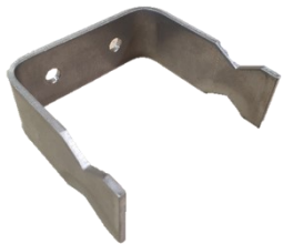
BSC4 Titanium Cradle 3mm Thick Sheet BSC4-75 — 75mm Long BSC4-94 — 94mm Long