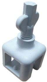
BCS1 Plastic Block With Hex Head Screw