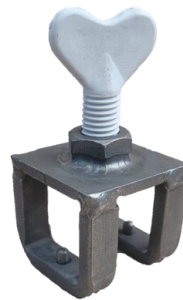
BCS3 Titanium Block With Screw