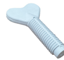
BCS2-SW Replacement Screw