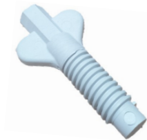
BCS1-SW Replacement Screw