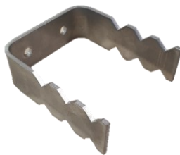
BSC5 Titanium Cradle 3mm Thick Sheet BSC5-75 — 75mm Long BSC5-94 — 94mm Long